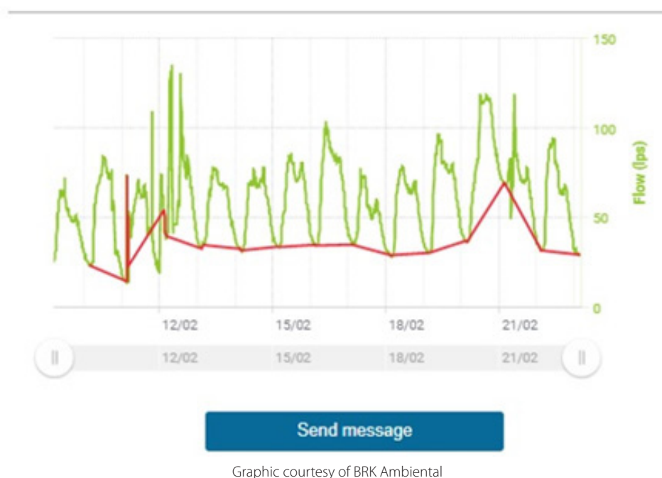
Figure 4. Setting an alarm for when minimum nighttime flow values (red line) exceed historic norms highlights abnormal flow events that can indicate an underground pipe burst.

"When I moved here, we experienced water shortages very often. I would get home late from work and there would be no water to do laundry... Over the past years, BRK improved the service in my neighborhood. We have water 24/7 now. Now, I get home and I can do my laundry, because there is water."