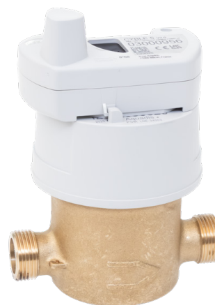
Aquadis+ equipped with the Cyble 5 module